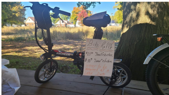
Small bike on left $25.00/ticket. Larger bike on right $50.00/ticket. Send your check payable to Salem Lutheran Church ( RTR) on the comment line.